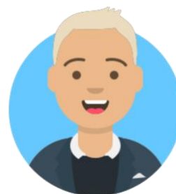
H Bridge Head teacher - DDSL