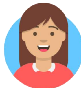
L Coull Intervention tutor - DDSL